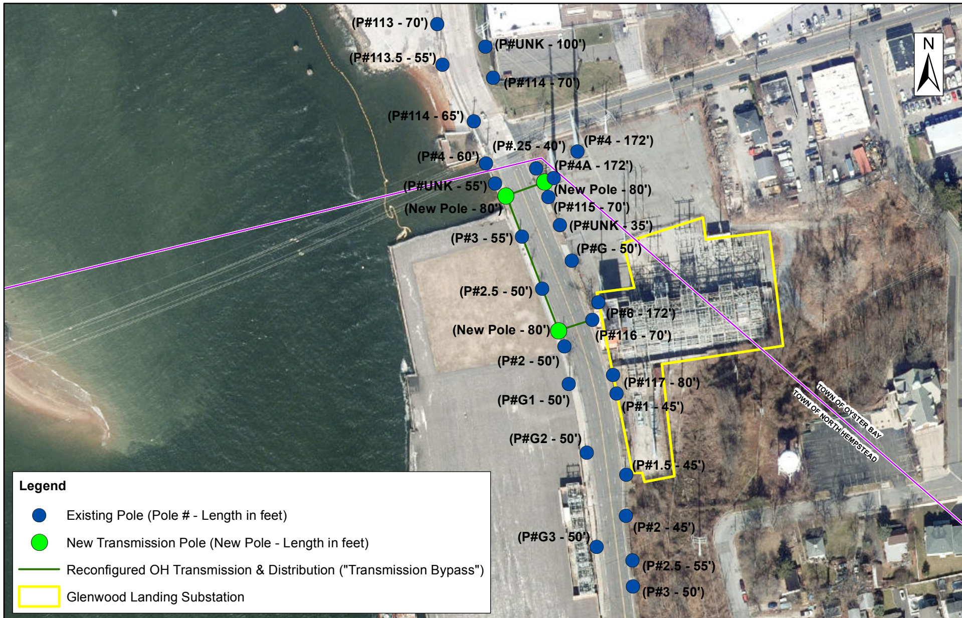
Figure 2 GLENWOOD SUBSTATION TRANSMISSION BYPASS NASSAU COUNTY, NEW YORK SITE LOCATION MAP