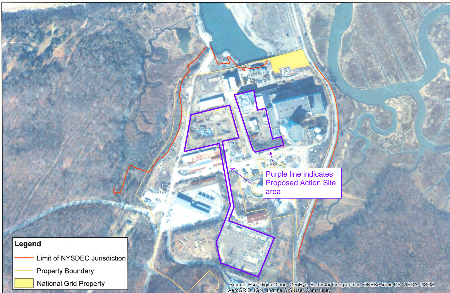
FIGURE 1 APPROXIMATE LIMIT OF NYSDEC TIDAL WETLANDS JURISDICTION